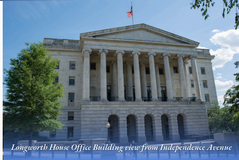
Longworth House Office Building view from Independence Avenue